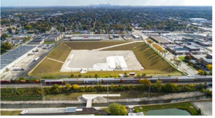
The Addison Creek Reservoir provides 195 million gallons of storage capacity and connects with the Addison Creek Channel (at bottom). Photo taken October 2022.

The MWRD worked closely on the design of the reservoir and channel improvements with Northlake, Melrose Park, Stone Park, Bellwood, Westchester, Broadview, the Illinois Department of Transportation, various railroads and several utility companies. The MWRD was required to obtain permits and approvals from the Illinois Department of Natural Resources Office of Water Resources, the Illinois Environmental Protection Agency, the United States Army Corps of Engineers, Soil and Water Conservation District and Illinois Historic Pres-