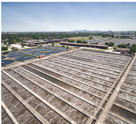
A biological process in 36 acres of aeration tanks removes suspended and dissolved solids from the wastewater.

Secondary treatment: A community of microorganisms helps remove organic material from the wastewater in secondary treatment. The microbes need oxygen to thrive, so air is pumped through the water in aeration tanks. Next, the water enters the final settling tanks where the remaining solids settle to the bottom, and clean water flows out the top. The clean water is released from the Stickney WRP into the Chicago Sanitary and Ship Canal. It only takes 12 hours for wastewater to be converted from raw sewage to clean water. The same transformation would require several weeks in a natural waterway.