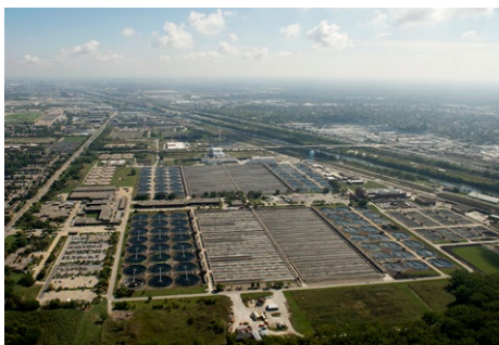
Stickney Water Reclamation Plant with the Chicago Sanitary and Ship Canal

The Stickney Water Reclamation Plant (WRP) is one of seven wastewater treatment facilities owned and operated by the Metropolitan Water Reclamation District of Greater Chicago (MWRD). The MWRD is the wastewater treatment and stormwater management agency for the City of Chicago and 128 Cook County communities. We work every day to mitigate flooding and convert wastewater into valuable resources, like clean water, phosphorus, fertilizers, biosolids and biogas.