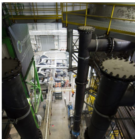
With its three mega-sized reactors, the MWRD's nutrient recovery facility can recover more than 85 percent of the phosphorus and up to 15 percent of the nitrogen from the water cleaned by the plant.

How do we know we're doing a good job? Wastewater treatment facilities are regulated under the Environmental Protection Agency's National Pollutant Discharge Elimination System (NPDES) permit program. NPDES permits set rigorous standards that the water from the plant must meet. The National Association of Clean Water Agencies has given the Stickney WRP the association's highest awards for compliance with these standards. We also see the benefits of our work resulting in increased recreation on the waterways, such as kayaking and canoeing, a rebounding aquatic habitat and increases in fish species. We're reducing energy use at our facilities with a goal of reducing greenhouse gas emissions, and we're recovering valuable resources and expanding the use of biosolids throughout the region.