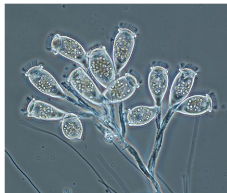
Microbes such as these stalked ciliates help remove bacteria and organic material from the water in secondary treatment.

How do we know we're doing a good job? Wastewater treatment facilities are regulated under the Environmental Protection Agency's National Pollutant Discharge Elimination System (NPDES) permit program. NPDES permits set rigorous standards that the water from the plant must meet. The National Association of Clean Water Agencies has given the Kirie WRP the association's highest awards for compliance with these standards. We also see the benefits of our work resulting in increased recreation on the waterways, such as kayaking and canoeing, a rebounding aquatic habitat, and increases in fish species. We're reducing energy use at our facilities with a goal of reducing greenhouse gas emissions, and we're recovering valuable resources, and expanding the use of biosolids throughout the region.