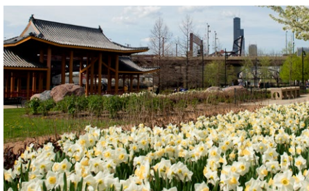
MWRD biosolids, a sustainable alternative to chemical fertilizers, help beautify the Chicago Park District's Ping Tom Park.