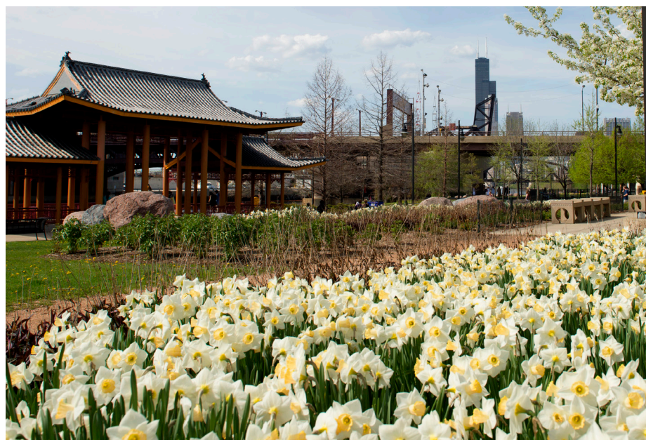
MWRD biosolids, a sustainable alternative to chemical fertilizers, help beautify the Chicago Park District's Ping Tom Park.