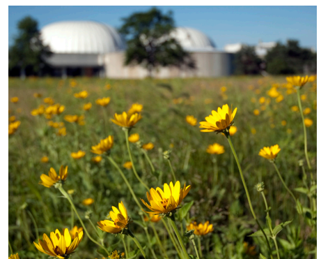
Native prairie on the grounds of Egan WRP.