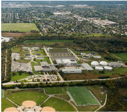
Egan Water Reclamation Plant

The John E. Egan Water Reclamation Plant (WRP) is one of seven wastewater treatment facilities owned and operated by the Metropolitan Water Reclamation District of Greater Chicago (MWRD). The MWRD is the wastewater treatment and stormwater management agency for the City of Chicago and 128 Cook County communities. We work every day to mitigate flooding and convert wastewater into valuable resources like clean water, phosphorus, biosolids, and biogas.