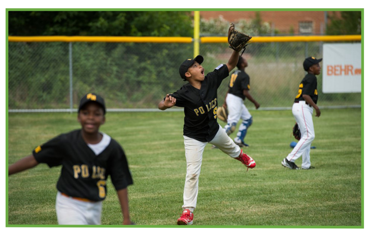
Baseball field in Ford Heights

MWRD soil scientist: How long have you been using MWRD biosolids?