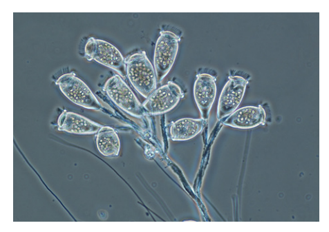
Microbes such as these stalked ciliates help remove bacteria and organic material from the water in secondary treatment.