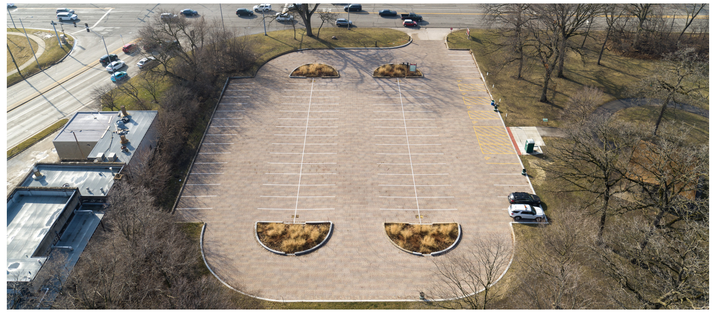
The MWRD and partners at the Forest Preserves of Cook County welcome visitors to the Schuth's Grove canoe and kayak launch with a permeable parking lot that uses brick pavers and bioswale islands to provide more than 110,700 gallons of stormwater storage each time it rains. Without these systems in place, that is thousands of gallons of stormwater that would have overwhelmed the forest preserves and Riverside area and topped over the banks of the Des Plaines River.

In 2014 and 2015, the District contributed to the Chi-Cal Fund for green infrastructure projects throughout the region. However, in 2016 the District decided to no longer contribute to the Fund in order to have more flexibility to fund projects with high DRCs in flood prone areas throughout its jurisdiction. However, the District has continued to work with the Chi-Cal team in evaluating projects that will reduce flooding, improve water quality and reduce loads to the local sewer systems.