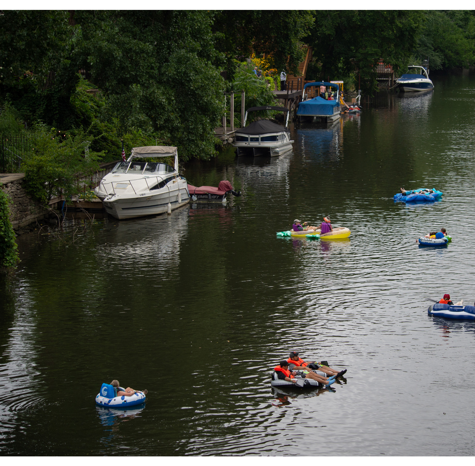
In a celebration of improved water quality, hundreds of floaters drift down the North Branch of the Chicago River to participate in the Friends of the Chicago River's Summer Float Party. The floats entered the water at a boat and canoe launch at River Park, where the MWRD partnered with U.S. Army Corps of Engineers and Chicago Park District to restore the surrounding riverbanks and remove a dam that improves fish migration and boat recreation.