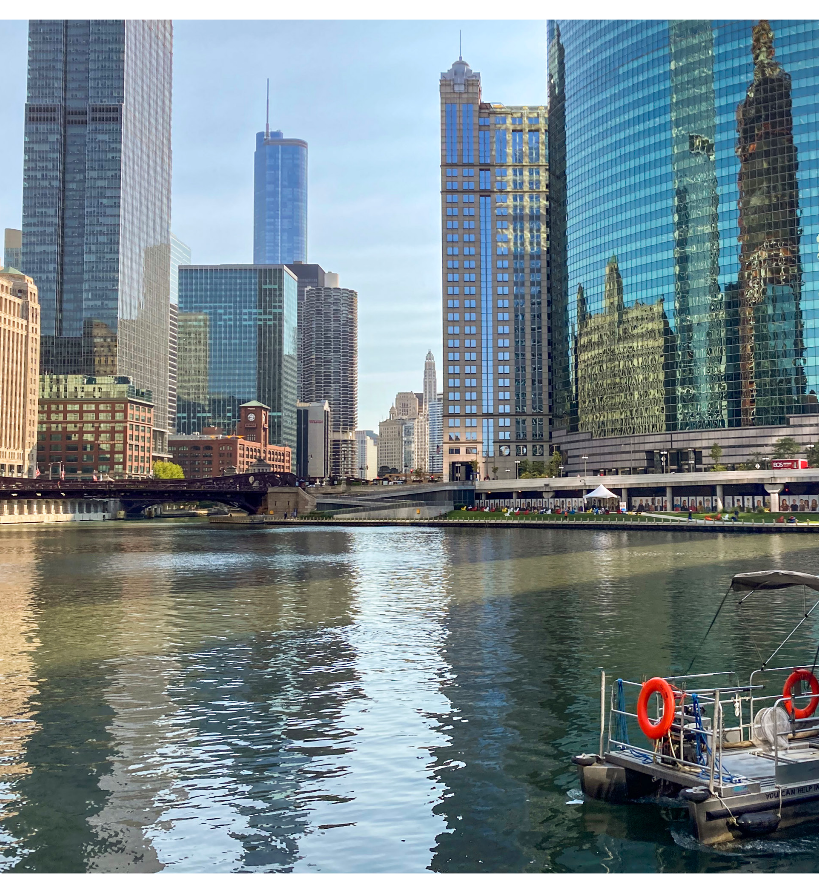
Along the Chicago River, the MWRD's skimmer boats operate with nets and other tools to scan and remove debris from the waterways. In the middle of the boat is a basket, which is kept at water level to collect debris as the boat trolls over it. The skimmer boats collect nearly 200 yards of debris each year, including cans, bottles, Styrofoam and plastic bags.