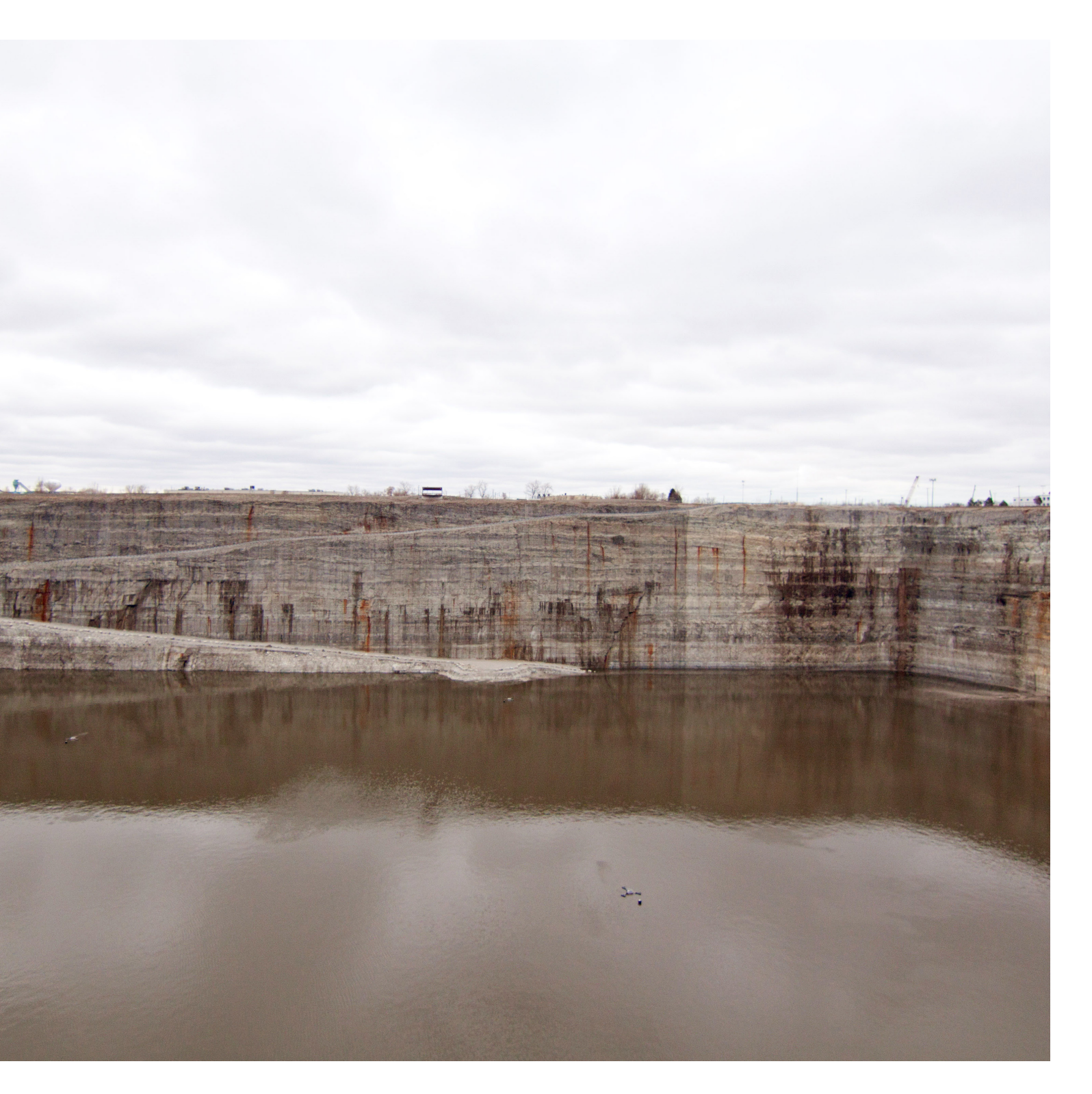
The Thornton Composite Reservoir prevents combined sewage and stormwater from entering and overwhelming Calumet area waterways. It contains the water before it can be conveyed by tunnel for treatment at the MWRD's Calumet Water Reclamation Plant. Since 2015, the reservoir has captured about 59.1 billion gallons from flooding local sewers, polluting waterways and backing up into local basements.