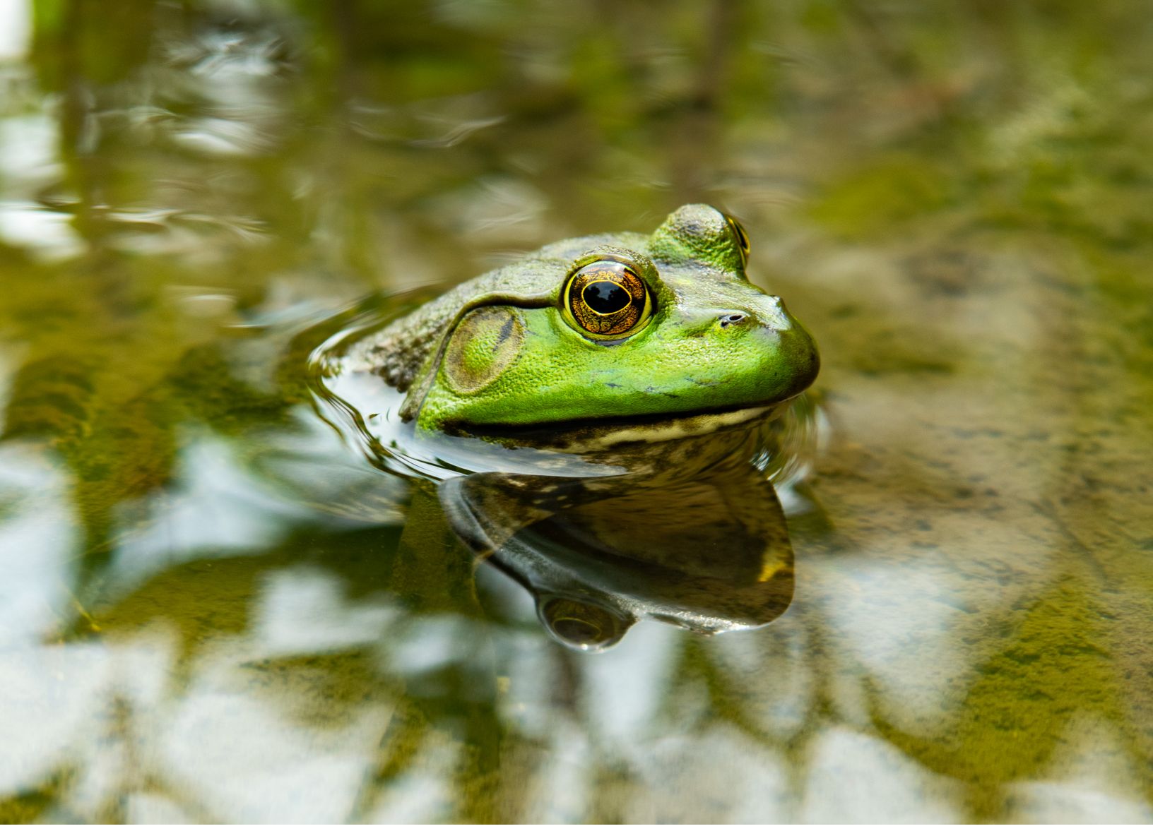
A frog enjoys the water in Addison Creek.