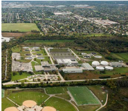
Egan Water Reclamation Plant

The John E. Egan Water Reclamation Plant (WRP) is one of seven wastewater treatment facilities owned and operated by the Metropolitan Water Reclamation District of Greater Chicago (MWRD). The MWRD is the wastewater treatment and stormwater management agency for the City of Chicago and 125 Cook County communities. We work every day to mitigate flooding and convert wastewater into valuable resources like clean water, phosphorus, biosolids, and biogas.