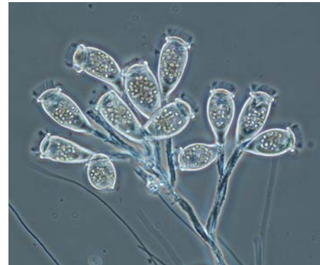
Microbes such as these stalked ciliates help remove bacteria and organic material from the water in secondary treatment.

Wastewater treatment facilities are regulated under the Environmental Protection Agency's National Pollutant Discharge Elimination System (NPDES) permit program. NPDES permits set rigorous standards that the water from the plant must meet. The National Association of Clean Water Agencies has given the Egan WRP the association's highest awards for compliance with these standards. We also see the benefits of our work resulting in increased recreation on the waterways, such as kayaking and canoeing, a rebounding aquatic habitat, and increases in fish species. We're reducing energy use at our facilities with a goal of reducing greenhouse gas emissions, and we're recovering valuable resources and expanding the use of biosolids throughout the region.