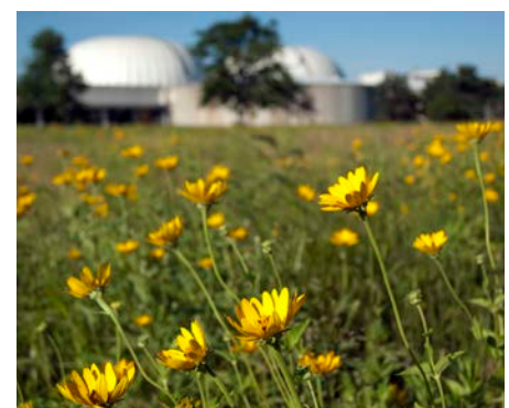
Native prairie on the grounds of Egan WRP.

About Egan WRP • 550 South Meacham Road Schaumburg, IL 60193 • 75 employees • 9 buildings on 275.4 acres • In operation since December 16, 1975 Receiving Stream • Upper Salt Creek Treatment Volume • 30 million gallons/day (avg.) • 50 million gallons/day (max.)