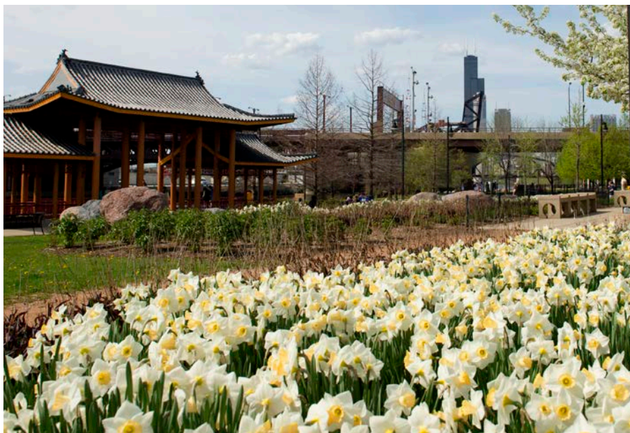
MWRD biosolids, a sustainable alternative to chemical fertilizers, help beautify the Chicago Park District's Ping Tom Park.